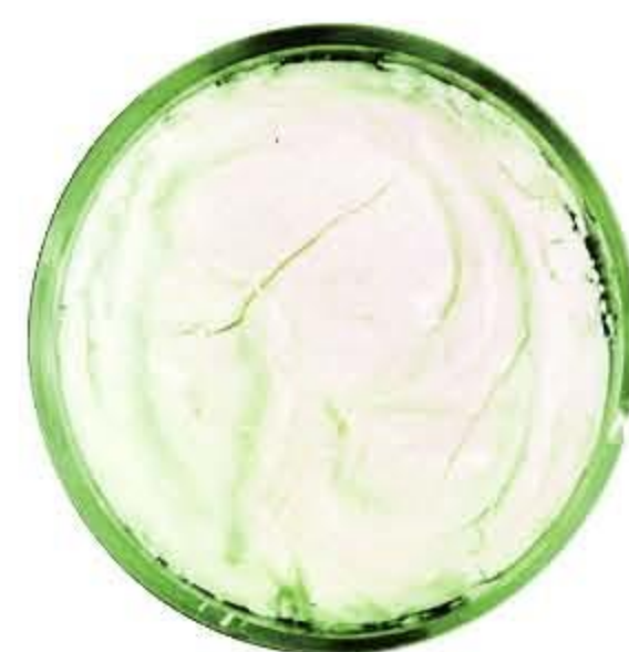
In oven at 232°C (448°F) for 40 hr: Krytox®—0% wt loss

Krytox® lubricants are more effective at even higher temperatures, regardless of operating duration. Using base oils, thickeners, and additives with chemistry designed to create high and low viscosity, these products are targeted for use solely in the very high-temperature range. Available in several grades that offer anticorrosion, extra bonding, and non-melting properties, these lubricants have applications in a variety of industries, including chemical, textile, tire, aviation, conveyor, glass, plastic film, nonwoven manufacturing, and mining and metal processing.