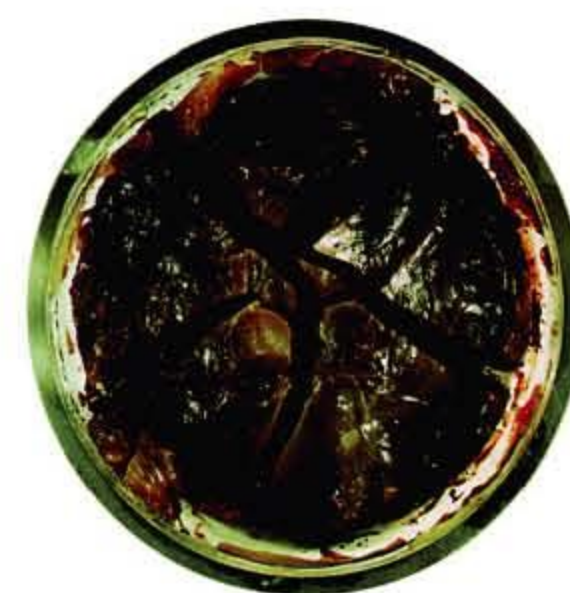
In oven at 232°C (448°F) for 40 hr: Hydrocarbon—40% wt loss